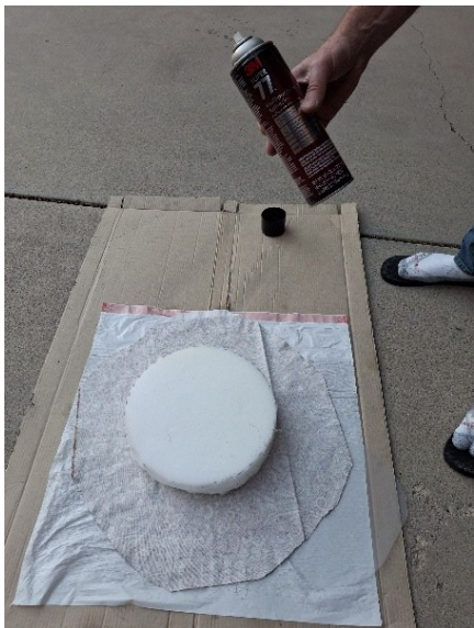
Step 4 - Lay foam circle centered on the backside of fabric