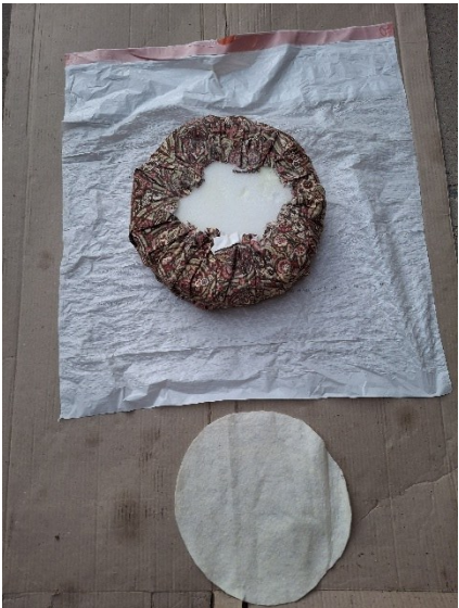
Step 3 - Cut 9" diameter circles from felt squares or any fabric.(make 9 or 10)