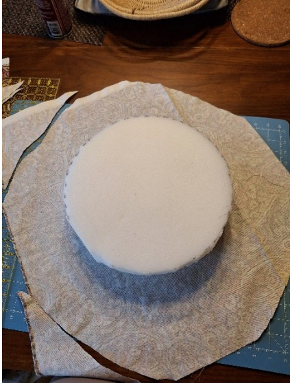
Step 2 - Cut fabric into 22" x 24" rectangular pieces. Trim off corners (make 9 or 10)